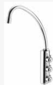
ROBINET - FAUCET