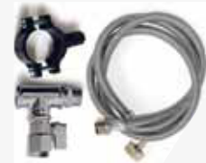
Kit d'installation Installation Kit