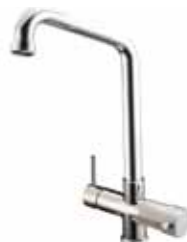
ROBINET - FAUCET Monocommande - a 5 voies - haut Single-control - Five-way mixer tap - high cane