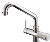
ROBINET - FAUCET Monocommande - a 5 voies - bas Single-control - Five-way mixer tap - low cane