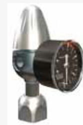
Reducteur pour bombe de CO2 avec manometre de pression Riducer for rechargeable gas cylinders with axial low pressure gauge