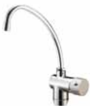
ROBINET - FAUCET 3 voies 3 water