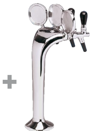
Cod 503 robinet 3 voies brass colum with 3 ways