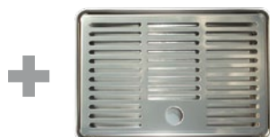
Cod 350.001 cm.15x22 inox