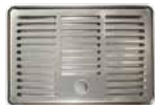
Cod 350.001 cm.15x22 inox Cod 350.002 cm.30x18 inox Cod 350.003 cm.40x22 inox