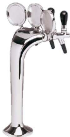
Cod 503 colonne a 3 voies brass colum with 3 ways