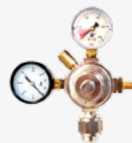
Reducteur de pression pour CO 2 Pressure reducer