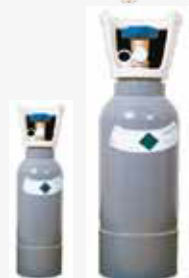
Bombonne CO 2 rechargeable 4 o 10 Kg CO 2 cartridge rechargeable 4 or 10 kg